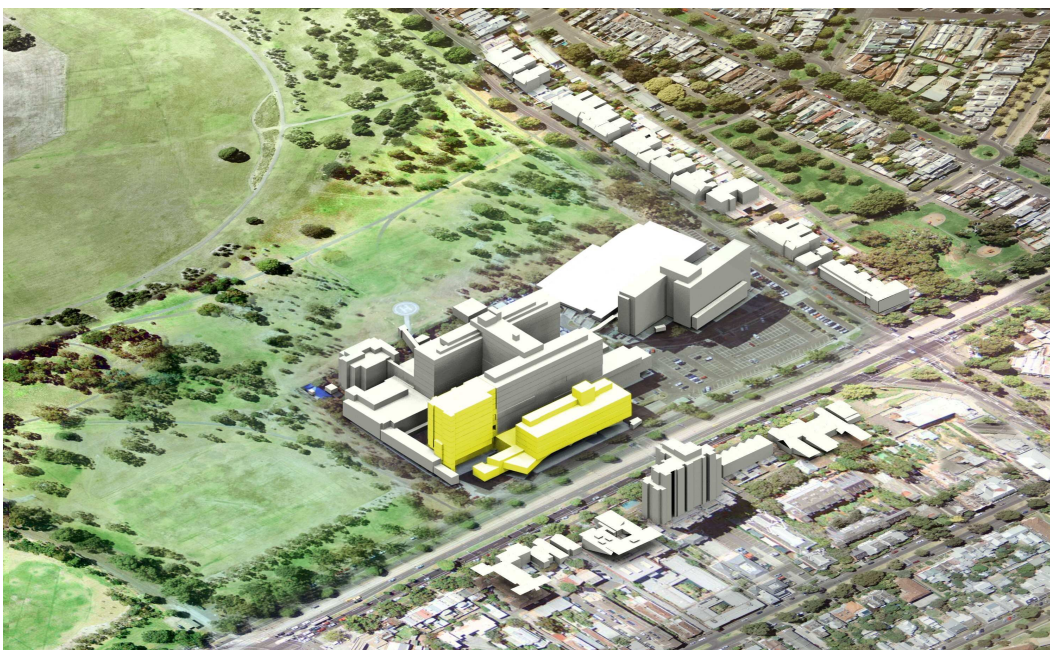
Figure 1: Existing RCH facility

Figure 1 is a representation of the existing RCH site, with the Front Entry Building and Research Precinct Building highlighted in yellow. Figure 2 provides an artist's impression of the new facility.